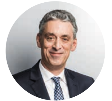
Frank Appel CEO - Deutsche Post DHL Group