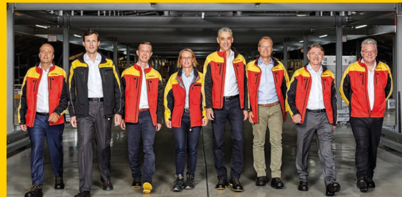
Board of Management, Deutsche Post DHL Group